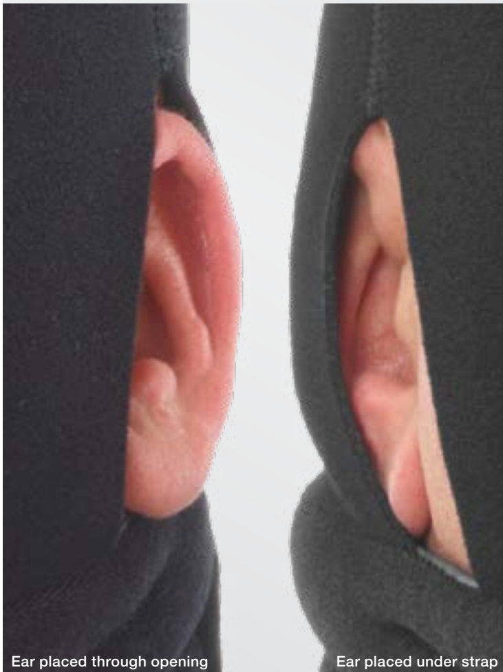
Ear placed through opening

Opening over ears help support hearing during garment use.