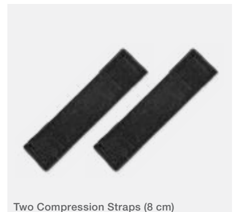
Two Compression Straps (8 cm)