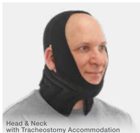
Head & Neck with Tracheostomy Accommodation