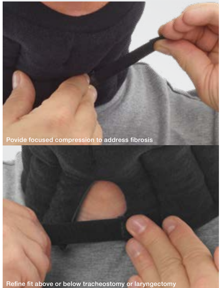
Provide focused compression to address fibrosis

Included Compression Straps are designed to provide a solution to address problematic areas of fibrosis and/or refine garment fit.