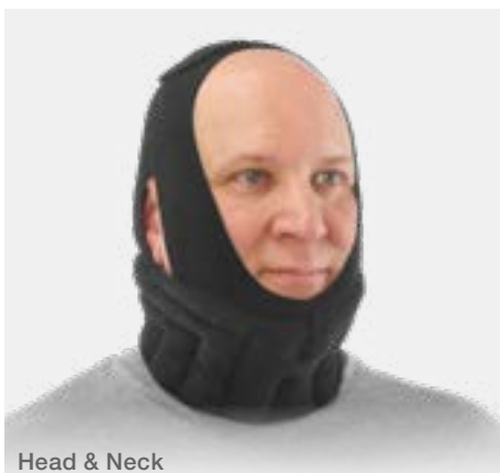
Head & Neck