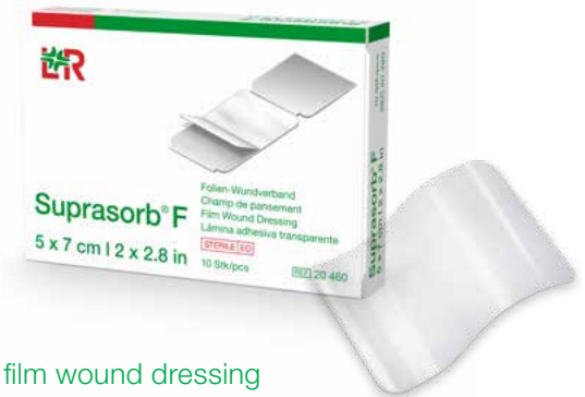
Suprasorb® F film wound dressing sterile, individually-sealed